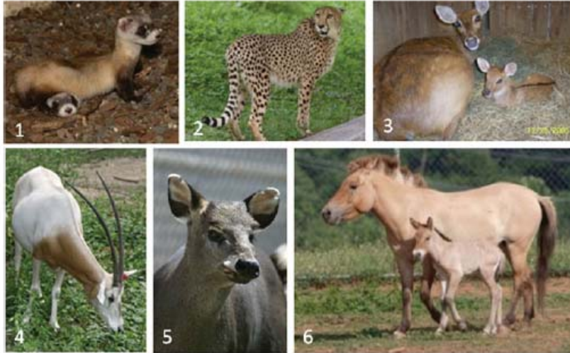
Fig. 7.1 Wild species that are intensively managed ex situ by the Smithsonian's National Zoological Park and partners: 1 black-footed ferret ( Mustela nigripes ), 2 cheetah ( Acinonyx jubatus ), 3 Eld's deer ( Cervus eldii thamin ), 4 scimitar-horned oryx ( Oryx dammah ), 5 tufted deer ( Elaphodus cephalophus ), and 6 Przewalski horse ( Equus ferus przewalskii ). Ovarian tissue samples from these species have been cryopreserved and are currently stored in the Genome Resource Bank at the Conservation Biology Institute

which allows transporting semen between breeding locations (without the need for moving stress-vulnerable, wild individuals) and overcoming the common problem of sexual incompatibility between computer-selected mates. Examples have been recently reviewed and include the giant panda [14], black-footed ferret [5] (see Fig. 7.1), and scimitar-horned oryx ([15] see Fig. 7.1), the latter two species being returned to the wild after intensive management that includes AI. Embryo-related technologies